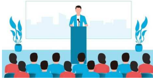
Seminars from specialists on teaching and pedagogy