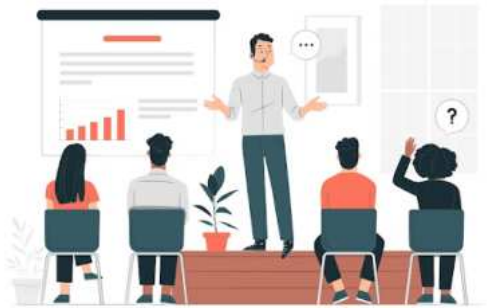
Finding a group of postdocs for teaching/presenting practice